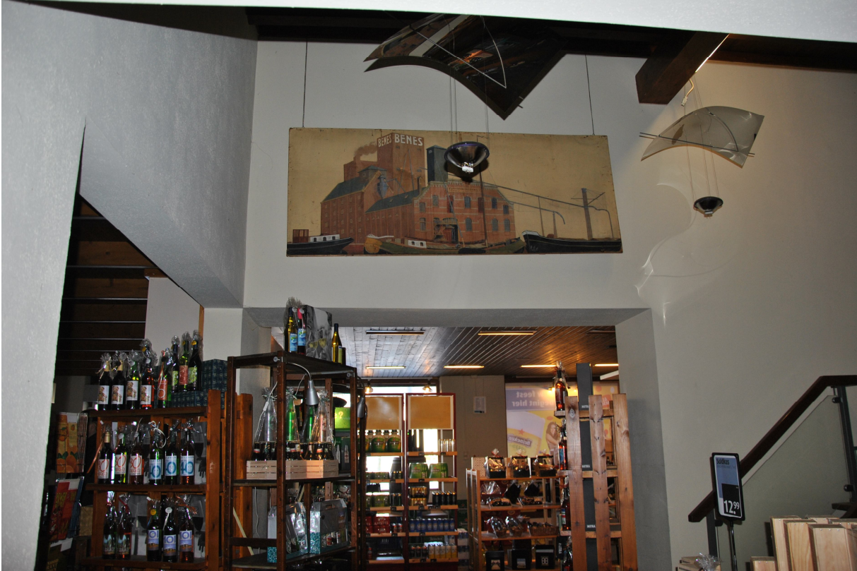
N.V. v/h Firma Wed. J.G. Benes, Hoogezand.